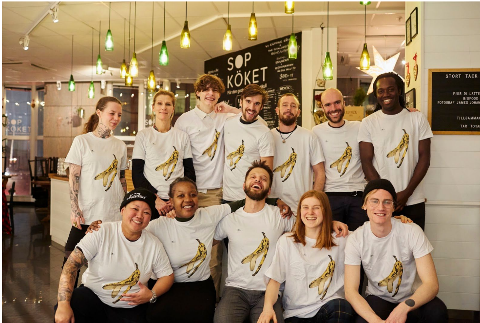
Sopköket team dec 2019