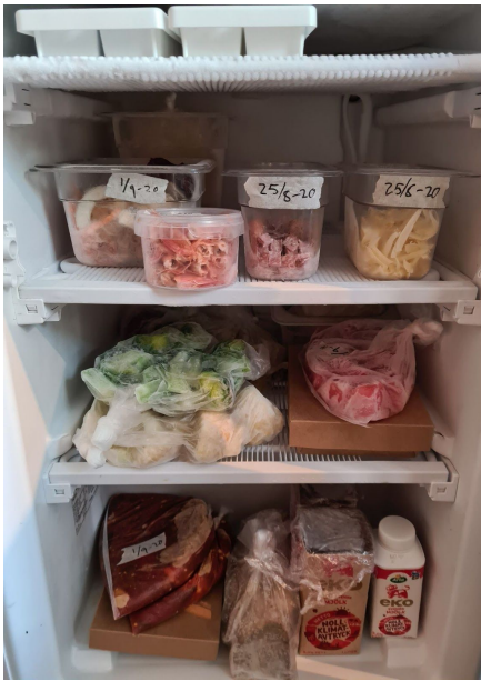
Filip's freezer 3/9 - 2020, brothholm